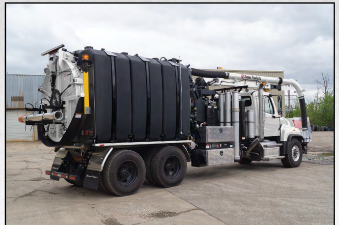
Camel 1200 / 12 Yard Debris Body