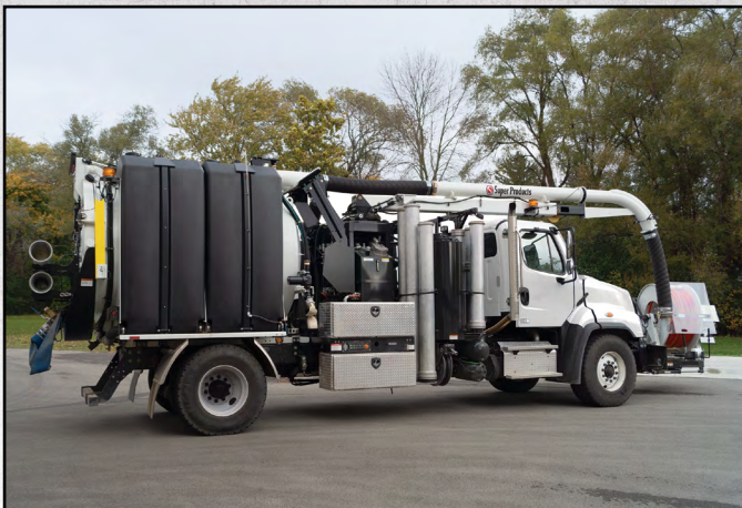
Camel 900 / 9 Yard Debris Body